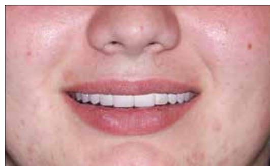
Fig. 3. Computer simulation of anticipated results.