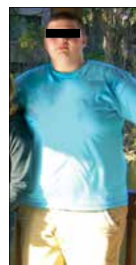
Fig. 7. Photograph of patient at beginning of treatment.