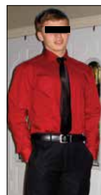
Fig 8. Photograph of patient 1 year post-treatment.

dentinogenesis imperfecta is little or no pulpal tissue. 2 No pulpal canal could be seen on the patient's radiograph. To avoid compromising the structural integrity of the already weak dentin, it was decided to avoid conventional endodontic treatment through the tooth and instead perform apical access to debride the lesion and seal the tooth with an amalgam restoration.