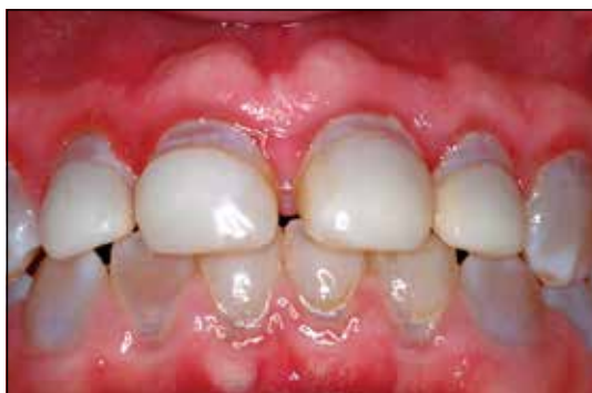
Fig. 4. 8 weeks post crown-lengthening surgery.