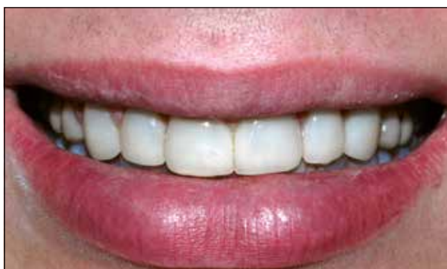
Fig. 6. Final smile (compare to Fig. 3).