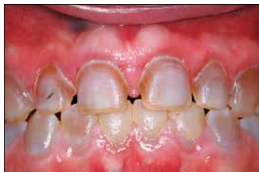
Fig. 5. Maxillary veneer preparations.