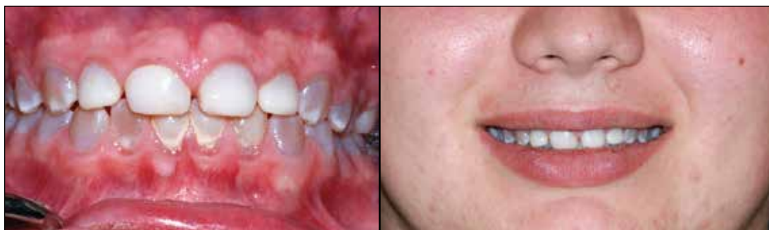
Fig. 1. Left. Pretreatment close up of anterior teeth. Right. Facial view of patient's smile pretreatment.